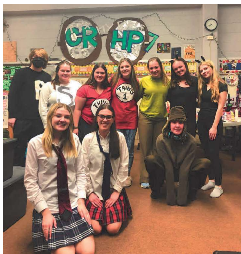
Prayer for our teen retreat leaders. Shine Your Light 4/23 & 4/24